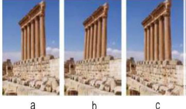
(a) Original (b) Planar (rotation) (c) Perspective (no distortion)

The Geometric distortion can be divided in two ways:linear geometric distortion and angular geometric distortion. The linear geometric distortion occurs during the rotation and translation in motion. In this position the pixels gets shifted or overlapping of pixels happened. The angular geometric distortion occurs during the mapping like 3-D plane to 2-D plane. Fig. 3 shows two examples of geometric distortions in multicamera images.