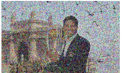
Fig. 4b Distorted Image (Photometric)