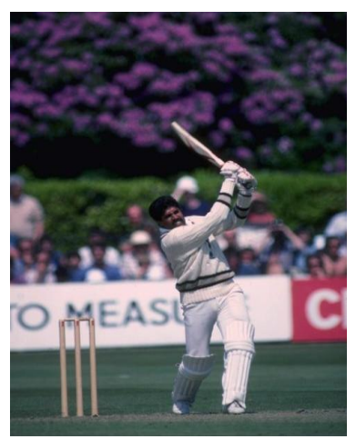
Figure 5a: Original Image

Texture index: Texture index includes mostly two algorithms SSIM and MSSIM the SSIM algorithm is considered a single-scale approach that achieves its best performance when applied at an appropriate scale. Moreover, choosing the right scale depends on the viewing conditions, for example viewing distance and the resolution of the display. Therefore, this algorithm lacks the ability to adapt to these conditions. This drawback of the SSIM algorithm motivated researchers to design a multi-scale structural similarity index (MS-SSIM). The advantage of the multi-scale methods, like MS-SSIM, over single-scale methods, like SSIM, is that in multi-scale methods image details at different resolutions and viewing conditions are incorporated into the quality assessment algorithm. In MS-SSIM algorithm after taking the reference and test images as input, this algorithm performs low-pass filtering and down sampling (by factor of 2) in an iterative manner.