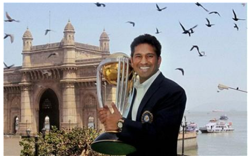
Fig.4a Original Image

International Journal of Advanced Research in Computer and Communication Engineering Vol. 5, Issue 6, June 2016