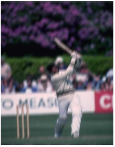
Figure 5b: Distorted Image (Geometric)